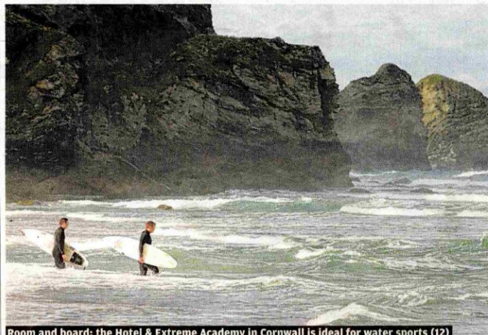
Room and board: the Hotel & Extreme Academy in Cornwall is ideal for water sports (12)

Where The Scarlet, Tredragon Road, Mawgan Porth, Cornwall, TR8 4DQ (01637 861800; www.scarlethotel.co.uk) How much From £165 with breakfast