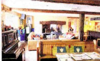
The inn crowd: Felin Fach Griffin in Brecon (23)

"One of Britain's newer country-house retreats, Lime Wood was originally a medieval hunting lodge," says James. "This New Forest manor pays attention to detail, with manicured grounds, contemporary interior design, a super new spa and two restaurants. It's grown-up, but not at all stuffy." Where Lime Wood, Beaulieu Road, Lyndhurst, Hampshire, SO43 7FZ (023 8028 7177; www.limewoodhotel.co.uk) How much Doubles from £190 with breakfast