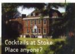
Cocktails at Stoke Place anyone?

Often associated with boring business trips, it's no wonder hotel bars get a bad rap. But that's set to change with a flurry of new boutique bars opening nationwide. In Bucks, check out The Garden Bar at Stoke Place . Housed in the 17th-century house, this chic countryside getaway is ideal for ladies (of the manor) who want to curl up on the sofa with a cocktail. Or try Layla in Liverpool – a five-star boutique hotel created out of restored 1920s buildings – for its NY-style bar, Madison's . We're also counting down till the grand opening of The Wellesley , Knightsbridge, later in the year – a prohibition-style Jazz Room? We're never checking out.